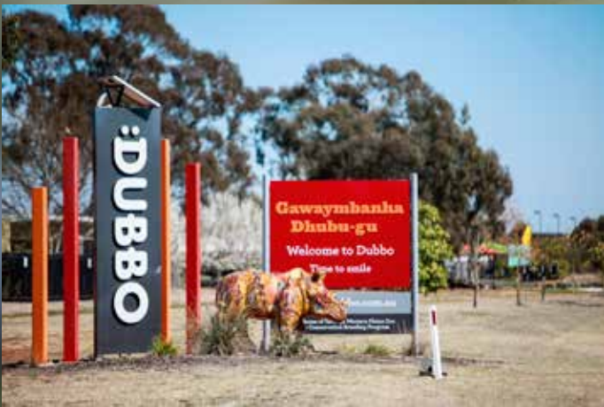
Dubbo: The home of Taronga Western Plains Zoo